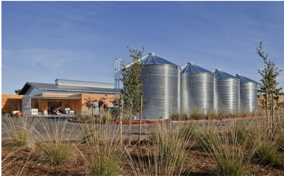
Figure 2 Rainwater collection and storage tanks at Robert Mondavi Institute.

At the UC Davis Robert Mondavi Institute Winery, there are four water tanks capable of capturing and storing 176,000 gallons of rainwater. The stored water is treated on-site, and is used for vineyard irrigation and cooling of fermentation tanks. Figure 2 below is a picture of the four storage tanks.